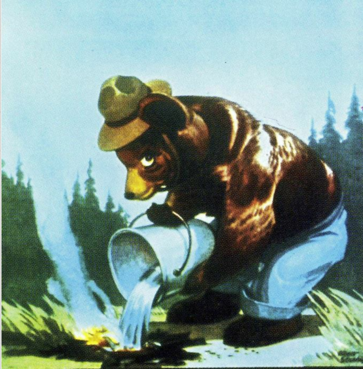
The first depiction of Smokey Bear, August 9th, 1944